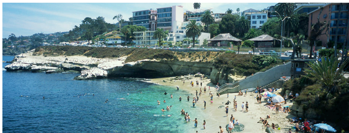
The coastal community of La Jolla is home to the UCSD campus.

The 65th Annual Meeting of the American Physical Society's Division of Fluid Dynamics (DFD) will be held in San Diego, California, from Sunday, November 18 to Tuesday, November 20, 2012. The meeting will be hosted by the University of California, San Diego, with participation of the University of San Diego and San Diego State University.