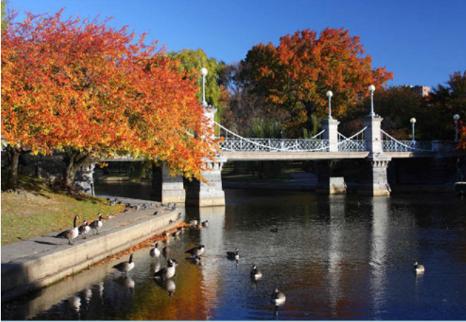
Boston Public Garden

There's history to be enjoyed as well as the freshest local seafood. The Freedom Trail takes you by 16 historically significant sites. There are movies under the stars and star-studded concerts. Enjoy a Boston tradition with a spin or two around the Frog Pond.