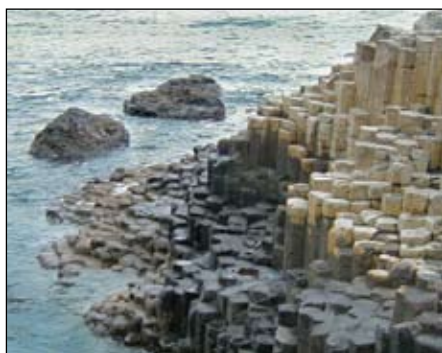
The Giant's Causeway

Among the more surprising findings: (1) the columns are not quite as perfectly hexagonal as previously believed, and (2) the continuous