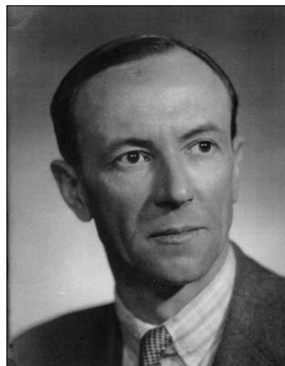
James Chadwick

The discovery of neutron quickly changed scientists' view of the atom, and Chadwick was awarded the Nobel Prize in 1935 for the discovery. Scientists soon realized that the newly discovered neutron, as an uncharged but fairly massive particle, could be used to probe other nuclei. It didn't take long for scientists to find that hitting uranium with neutrons resulted in the fission of the uranium nucleus and the release of incredible amounts of energy, making possible nuclear weapons. Chadwick, whose discovery of the neutron had paved the way for the atomic bomb, worked on the Manhattan Project during WWII. He died in 1974.